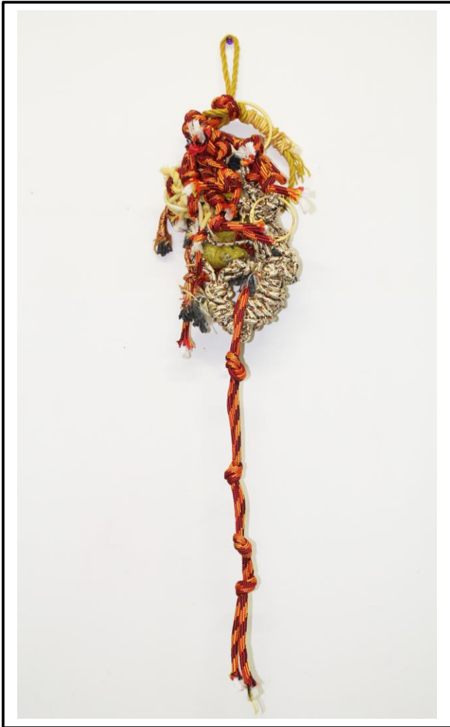
Juan Gomez SOBRESALIENDO Index Card Rings on Rope 32" x 8" x 2" 2021