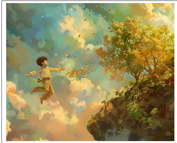
Jeff Alu FLYBOY Still from AI Movie 2024