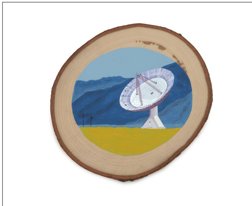
Hilary Baker ANTENNA Rounded Birch Slice 2024