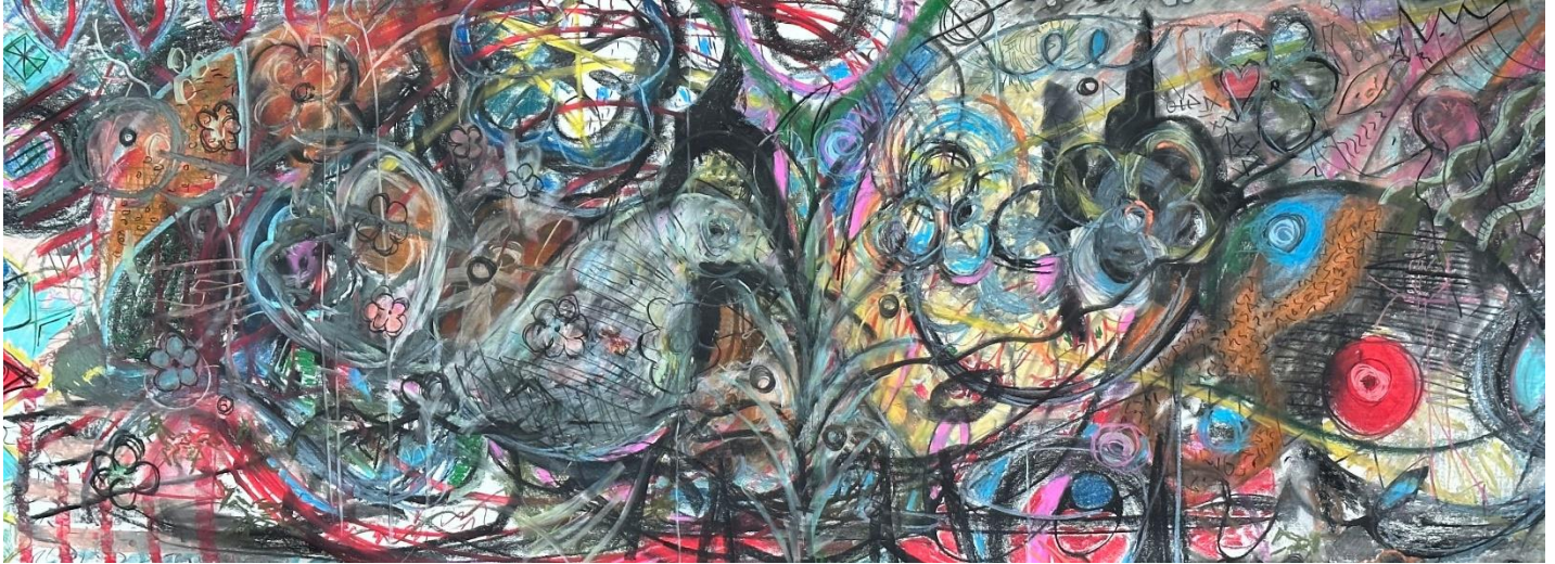
"ENSEMBLE NO. 7 2024" 4' x 8' pencil, charcoal and pastel on paper Roderick Smith Atelier