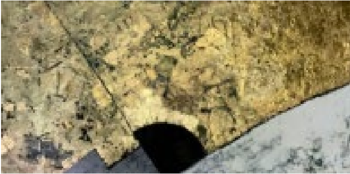
Oil and Gold Leaf on Canvas 24" x 48"