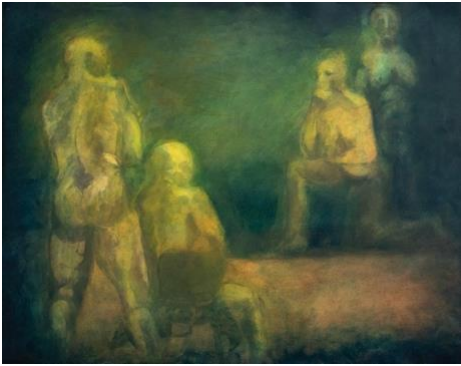
Robin Repp, Confrontation Acrylic, Oil paint and Galkyd, 22" x 28"